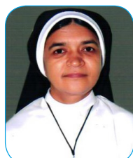
SR DAISE FLOWER FCC Nursing