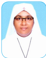
SR. TEEJA S D NURSING