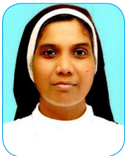
SR. PAVITHRA CPS CENTRAL STORE