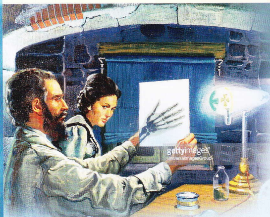
Rontgen, Wilhelm Conrad (1845-1923), German physicist, Discovered Roentgen rays